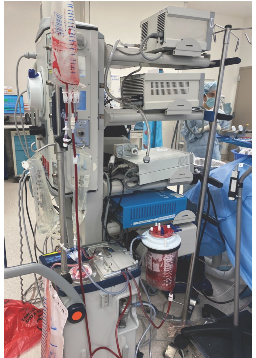
This figure depicts use of a “cell saver” device during liver transplantation. Blood is suctioned from the surgical field, mixed with a citrate or heparin solution, collected in a reservoir, and centrifuged. The red blood cells are then mixed with saline to reinfuse to the patient.