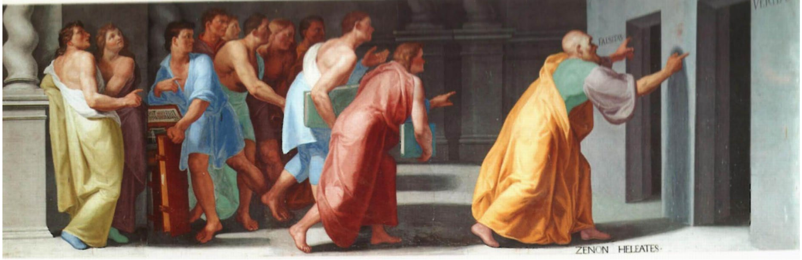
Zeno shows the Doors to Truth and Falsity (Veritas et Falsitas). Fresco in the Library of El Escorial, Madrid.

Patient blood management (PBM) ensures that a patient's blood is acknowledged and managed as being an important component of clinical care in optimizing individual patient's outcomes, in all medical and surgical settings. As a corollary to successful PBM allogeneic blood transfusion is minimized or avoided and ethical stewardship of altruistically donated blood is ensured.