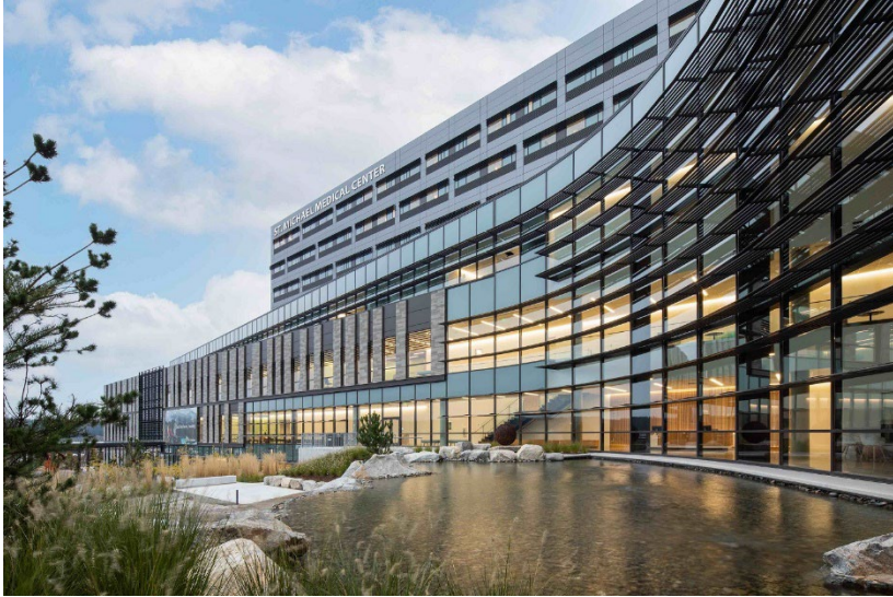
St. Michael Medical Center - Virginia Mason Franciscan Health, Tacoma, WA, USA

Virginia Mason Franciscan Health (VMFH) is one of the leading healthcare systems in Washington State, providing healthcare services at 10 hospitals and nearly 300 care sites across the Puget Sound region as part of the CommonSpirit Health system. The Transfusion-Free Medicine and Surgery Program (TMSP) at VMFH provides regional coverage to six of those hospitals, including 2 large medical centers, spanning 3 counties.